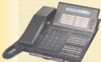
Executive Station With 2-Line Display