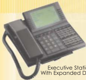
Executive Station With Expanded Display